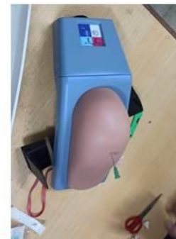
Intramuscular, subcutaneous trainer