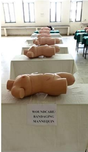
Wound care- bandaging trainer