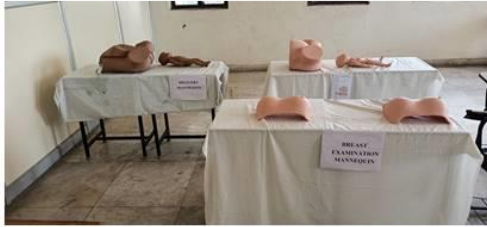
Delivery & Breast examination trainer